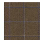
11 Khaki Kotes