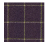
04 Purple Fairy