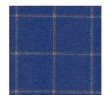
12 Babe the Blue