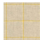
01 Shetland Pony