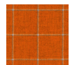
08 Scout Camp