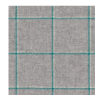
13 Standing Stone