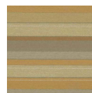
120 Mixed Nuts

*Multiple factors affect fabric durability and appearance retention, including end-user application and proper maintenance. Wyzenbeek results above 100,000 double rubs have not been shown to be an indicator of increased fabric lifespan.