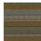
126 Good Earth