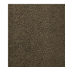
03 Sparkling Sand