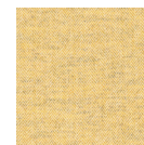
11 Mustard Seed